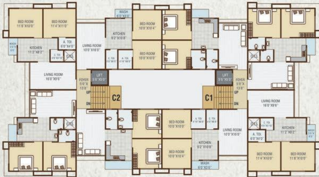
Building C TYPICAL FLOOR PLAN