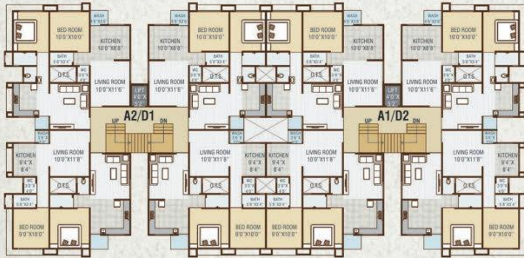
Building A & D TYPICAL FLOOR PLAN