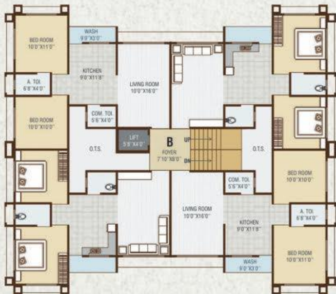
Building B TYPICAL FLOOR PLAN